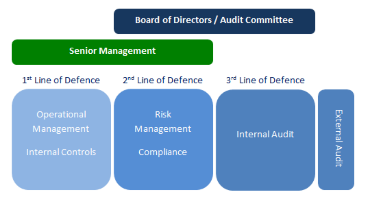
Three Lines of Defence Model

An effective risk management system also requires to be supported by a suitable internal control system. To this effect, the Board of Directors has adopted the Three Lines of Defence Model which provides a simple and effective way to enhance communications on risk management and internal control by clarifying essential roles and responsibilities and this is depicted in the following diagram: